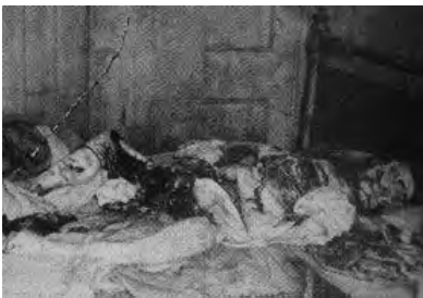
Mutilated body of prostitute Mary Jane Kelly, victim of the notorious Jack the Ripper.